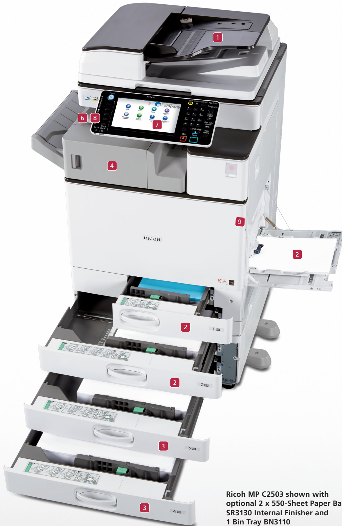
Ricoh MP C2503 shown with optional 2 x 550-Sheet Paper Bank, SR3130 Internal Finisher and 1 Bin Tray BN3110